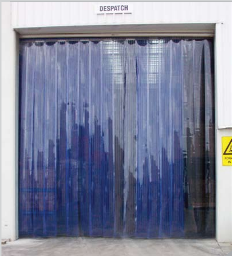
High performance ribbed strips ideal for forklift access and tough high usage applications