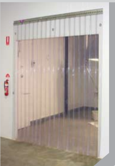
Raised headrail for high loads or low doors