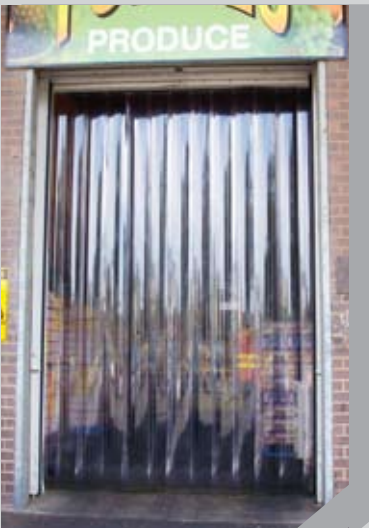
Ribbed strips used on warehouse applications