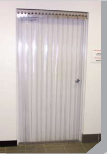
Personnel access stainless steel strip door