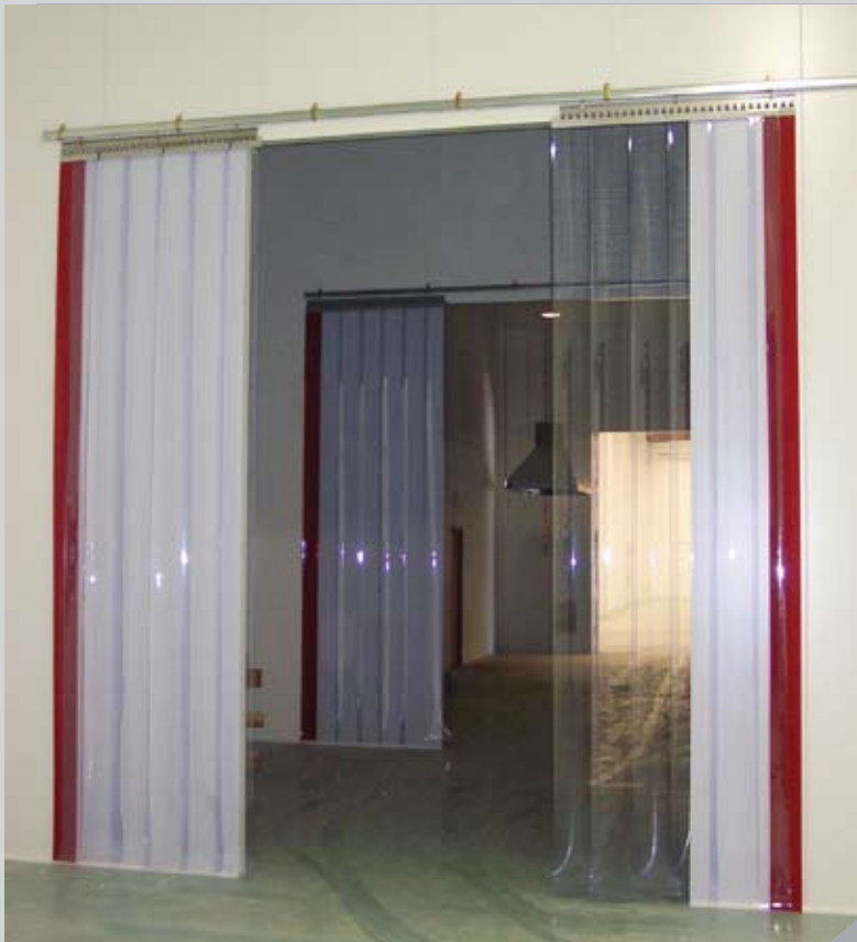
Dual sliding strip door on a single track with a combination of clear and coloured strips for safety