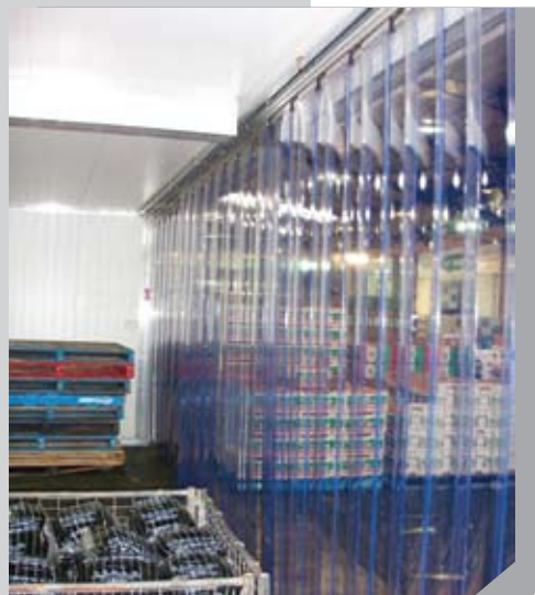
Sliding strip door system improves coolroom access