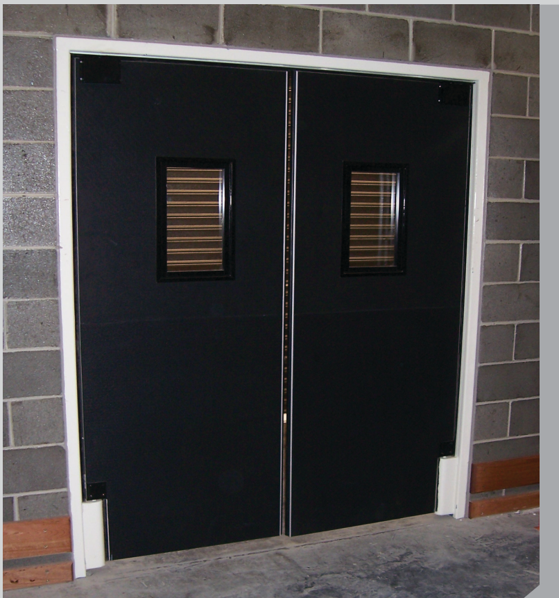
Double door designed to withstand heavy traffic from personnel trolleys and powered equipment