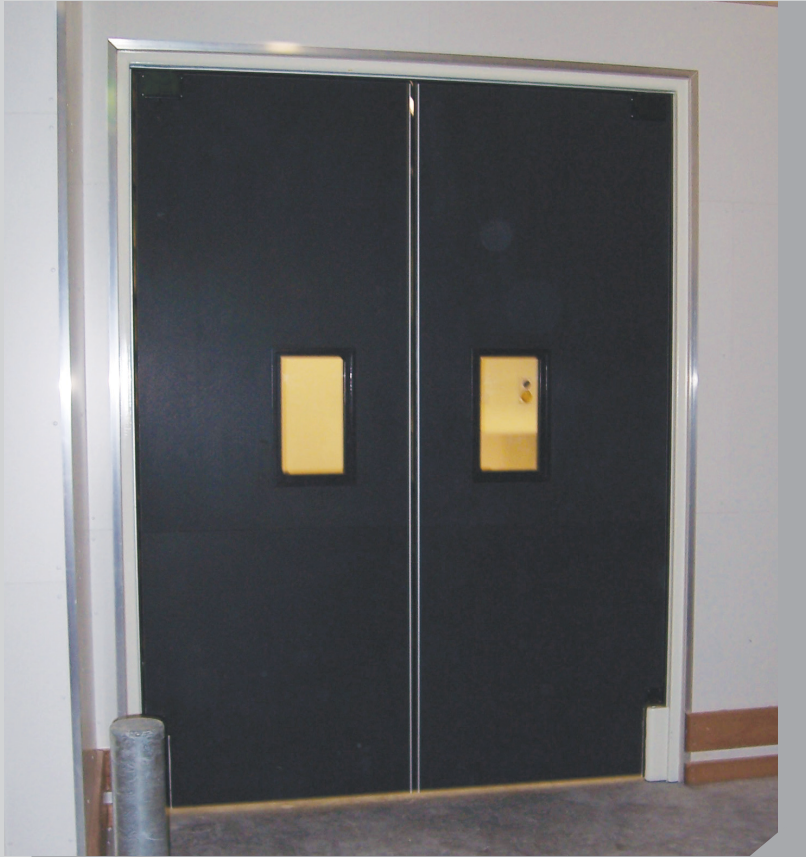
High performance double black high impact door separates the storeroom from the retail area