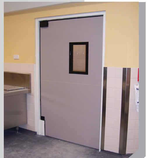
Single high impact door performance and presentation